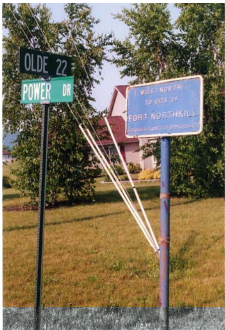
This Fort Northkill sign is located at Power Drive about two miles west of the Hochstetler farms on Olde 22, and reads, "1 mile north to site of Fort Northkill." There is apparently nothing left of the fort, built in 1756 during the French and Indian War. See DJH page 28.